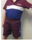
Girls Prep Uniform